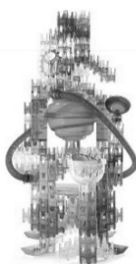
Q B Maze