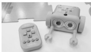
Botley Coding Robot