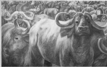
The Collective by Leah Lawton

Art exhibit by Leah Lawton will be on display from August 29th - September 29th